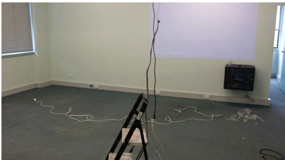
Photo : the new premises are being readied for re-commencement of classes on Sept 5

One unintended consequence of the sale of the CC is that the Cumann has to change its letterhead. The committee looked at this and realised that the artwork was set up so long ago it's archaic and cannot be changed easily. So, time to leap into the 21st century but no one on the committee has the skills to play around with graphic art. We're reaching out to the membership to ask if anyone would could help with this particular project?