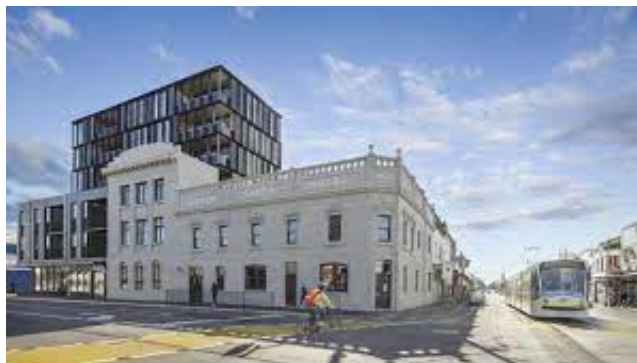
Ár mBaile nua ?.....Leathanach 5

Bheadh gá le láithreacha chruinnithe chuí, áisean-